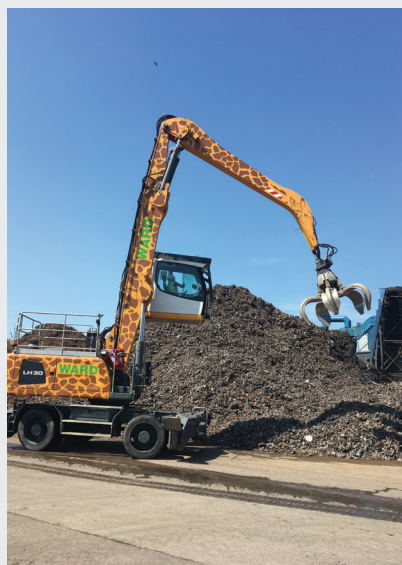
Movement and loading of metals for recycling