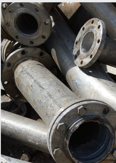
Sorting and grading of metal arising