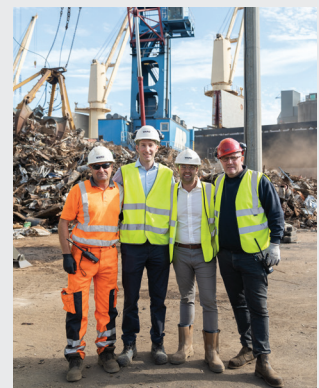
The Ward team on site at Immingham