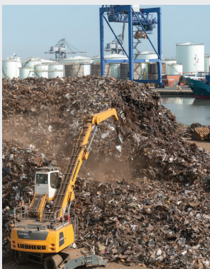
Ward's dock increases metal capabilities